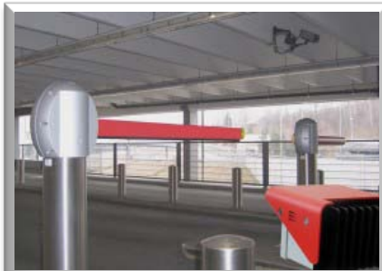
Parking & Access

We provide a strong portfolio to meet all of our customer's needs.