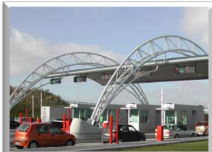
Toll Plaza Systems