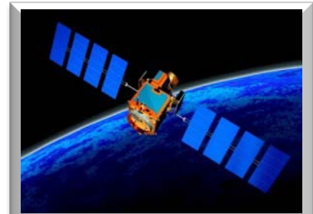
GNSS (Satellite Tolling)