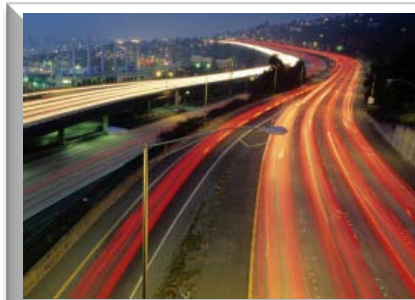
Electronic Toll Collection